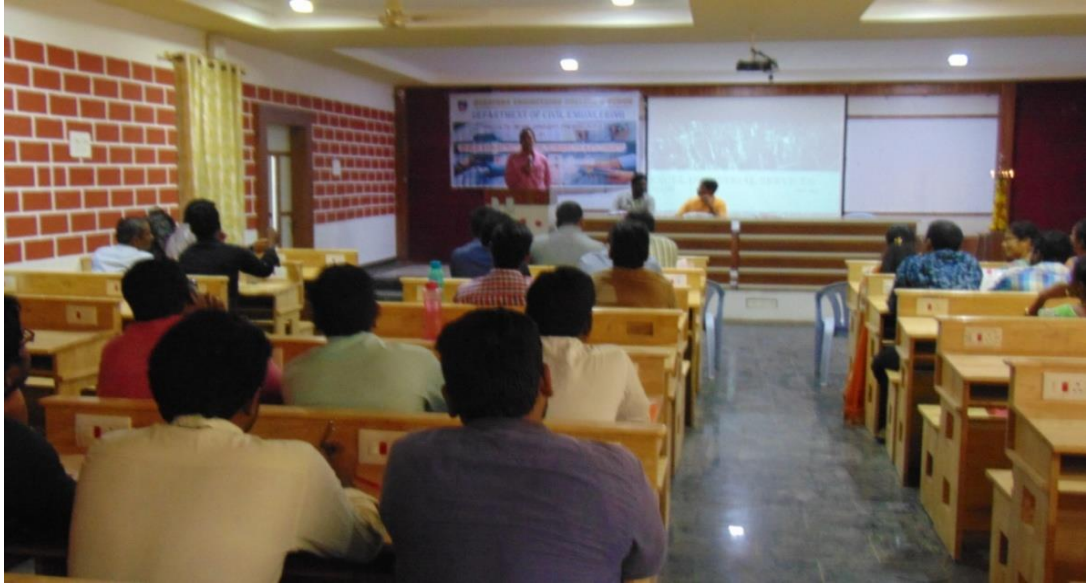
Participants during FDP