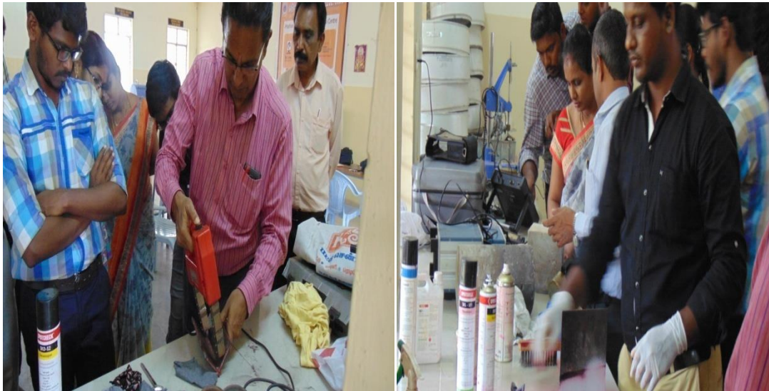
Demonstration of Non-Destructive testing tools